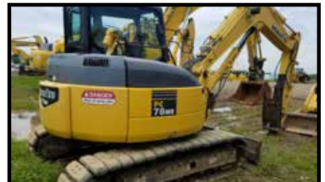
2009 Komatsu PC78MR-6 Stock# U26489, Cab, A/C, Blade, Cplr, Bucket, 2,910 Hrs. $65,000