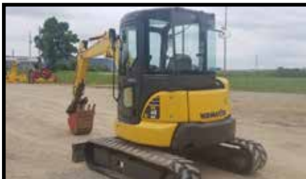
2015 Komatsu PC45MR-3 Stock# K10232T, Cab, A/C, Blade, Coupler, Bucket, 3,052 Hrs. $47,500