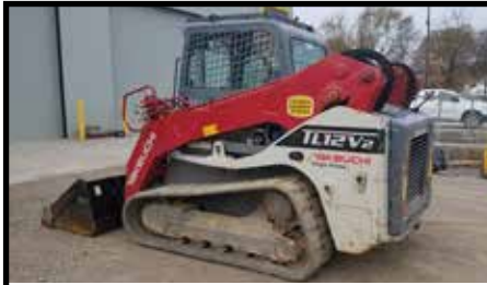
2015 Takeuchi TL12V2 Stock# 32240T, Cab, A/C, Bucket, 843 Hrs. $59,000

For a Complete List of Used Equipment, Please Visit www.columbusequipment.com