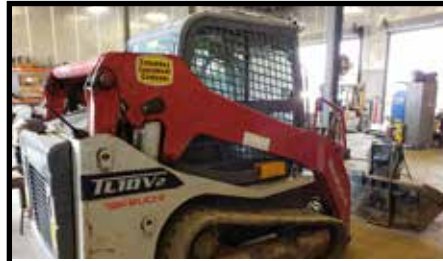
2016 Takeuchi TL10V2-CR Stock# R36366T, Cab, A/C, Heat, Tooth Bucket, Coupler, 1,690 Hrs $39,000