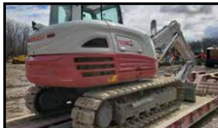
2018 Takeuchi TB290CL Stock# R34236, Cab, Aux Hyds, Blade, Coupler, 601 Hrs $95,000