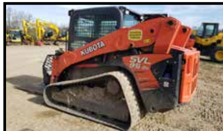
2018 Kubota SVL95-2SHFC Stock# 36640T, Cab, A/C, Heat, High Flow, Coupler, Bucket, 724 Hrs $59,000