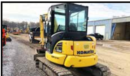
2018 Komatsu PC55MR-5 Stock# RDK10161, Cab, A/C, Blade, Cplr, Bucket, 2,049 Hrs. $52,000