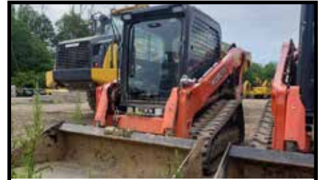
2019 Kubota SVL65-2HWC Stock# 38609T, Cab, A/C, Heat, Coupler, Bucket, 521 Hrs $49,000